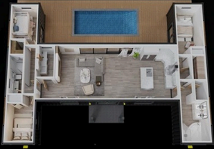
Floorplan View 1

Modern Light-Filled Haven With an open floor plan and ample natural light, this home offers a bright, welcoming ambiance for any lifestyle.