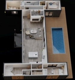
Floorplan View 3 Your Private Summer Oasis

$245K (LOT INCLUDED) 19% ROI FOR FLIP 8% CAP RATE FOR HOLD